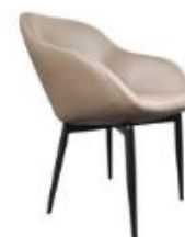
Code : LC-MB-001-SW 600 x 460 x 790mmH