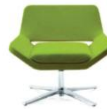
Code : LC-MB-001-PL 850 x 560 x 770mmH