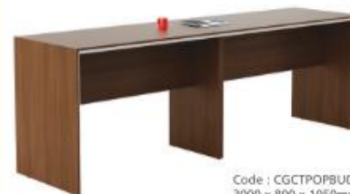
Code : CGCTPOPBU080A5 3000 x 800 x 1050mm