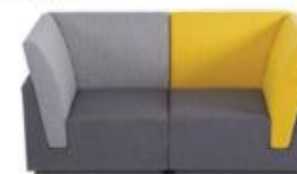
Code : FS-2S-003-CR 770 x 770 x 780 x 2 NOS