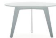
Code : CT-MB-002-PL Ø 500 x 420mmH