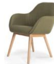
Code : LC-WB-004-CR 660 x 630 x 820mmH