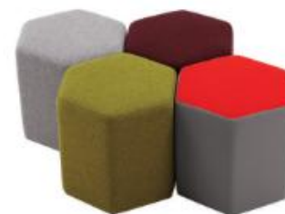
Code : PS-SP-001-CR 460 x 420H