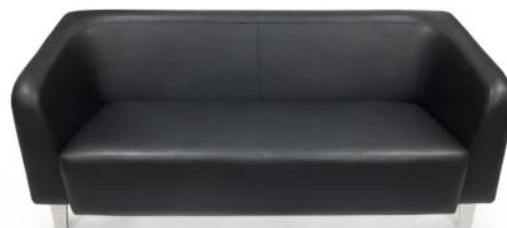
TURF 1/3 Seater