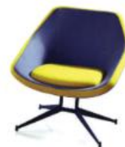
Code : LC-MB-001-CR 740 x 720 x 825mmH