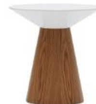
Code : CT-WB-002-PL Ø 500 x 560mmH