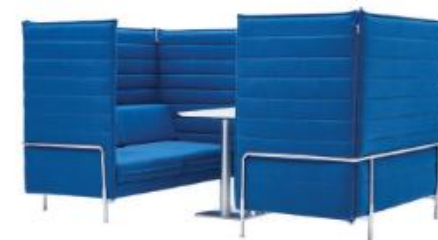
Code : FF-MB-007-CR 2640 x 1640 x 1400 Table : 1200 x 600 x 700mm