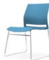
Code : CH-GALA