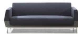
Code : FS-2S-001-CR 1470 x 790 x 780H