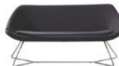
Code : FS-3S-002-CR 1580 x 720 x 450 x 780mmH