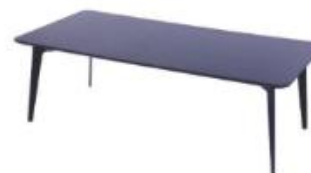
Code : CT-MB-017-CR 1400 x 700 x 450mm