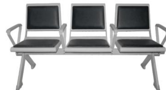
AMIGO 2/3 Seater (with Cushion)