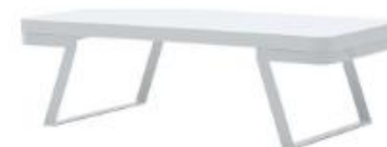
Code : CT-MB-003-PL 1200 x 600 x 380mm