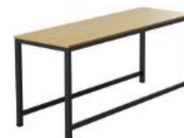
Code : CFT-MS-010-SW 1200 x 800 x 1050mm CFT-MS-011-SW 2400 x 800 x 1050mm CFT-MS-012-SW 2400 x 600 x 1050mm