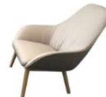
Code : LC-WB-001-CR 800 x 820 x 810mmH