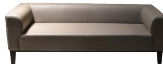
HOST 1/2/3 Seater