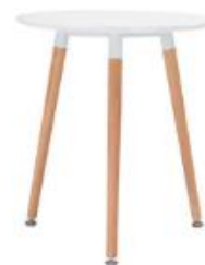
Code : CT-WB-001-PL Ø 500 x 605mmH