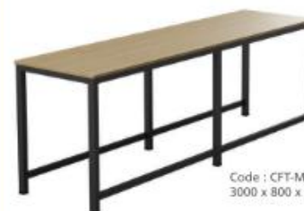
Code : CFT-MS-013-SW 3000 x 800 x 1050mm