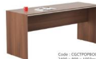
Code : CGCTPOPBO080A5 2400 x 800 x 1050mm