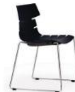
Code : DC-MB-006-CR