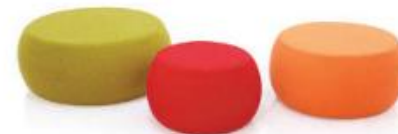
Code : PS-RO-001-KC Ø 670 x 380mm