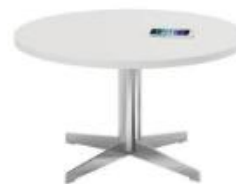
Code : CFT-SS-013/014/015-SW Ø 600/750/900 x 450mmH