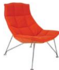
Code : LC-MB-001-KC 840 x 725 x 915mmH