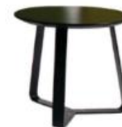
Code : CT-MB-016-CR Ø 500 x 450mmH