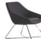
Code : FS-1S-002-CR 740 x 720 x 450 x 780mmH