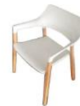
Code : DC-WB-001-SZ