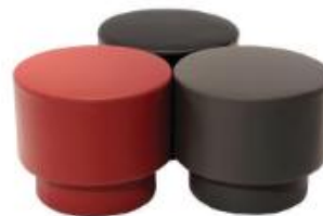
Code : PS-RO-001-TC Ø 450 x 420H