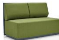
Code : FS-2S-003-PL 1300 x 650 x 830H