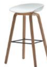
Code : HT-WB-001-PL 480 x 520 x 940mm