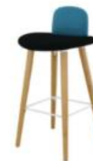
Code : HC-WB-001-KC 475 x 475 x 865mm SH 780mm