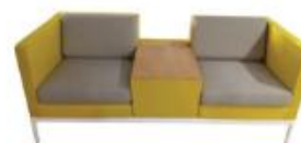
Code : FS-2S-002-PL 1800x820x740H