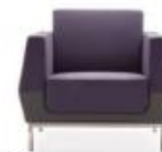
Code : FS-1S-001-CR 880 x 790 x 780H