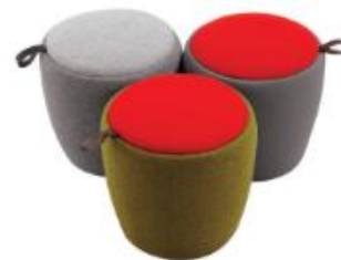
Code : PS-CP-001-CR Ø 410 x 400H