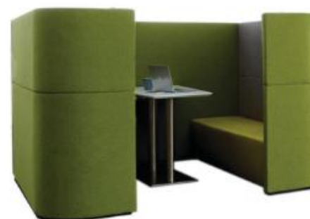
Code : FF-MB-005-CR 2150 x 1800 x 1350H Table : 1200 x 600 x 700mm