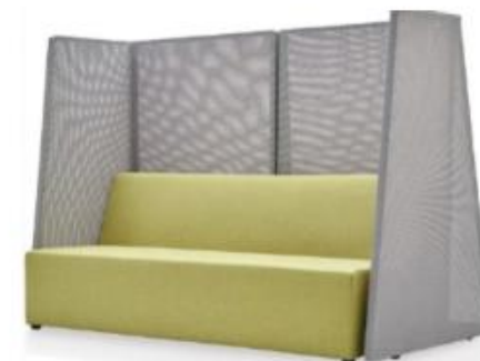
Code : FF-MB-006-CR 1810 x 810 x 745mm Mesh back shelf left & right- 1080 x 978 x 1416mm