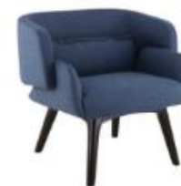
Code : LC-WB-001-KL 640 x 750 x 700mmH