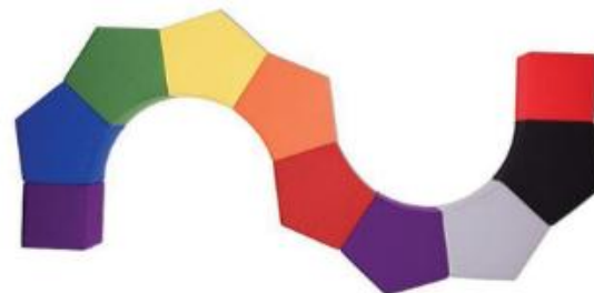
Code : PS-YO-001-CR 730 x 630 x 385mm