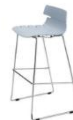
Code : BS-MB-002-CR 500 x 590 x 970mm SH 760mm